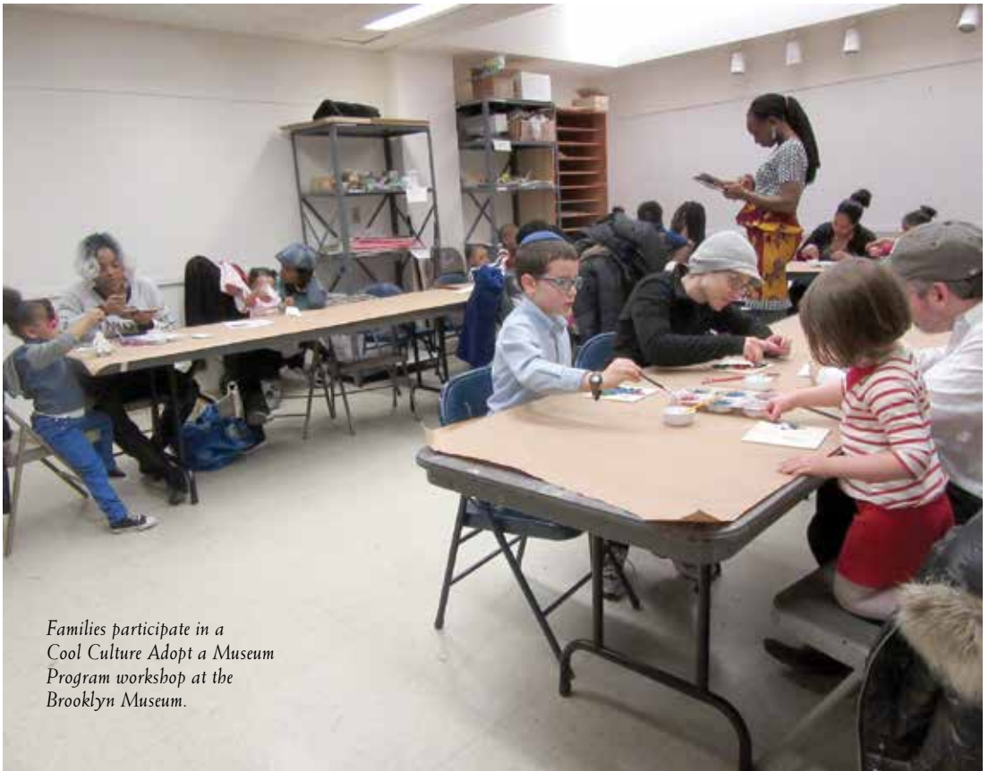
Families participate in a Cool Culture Adopt a Museum Program workshop at the Brooklyn Museum.

For the Cultural Literacy Behind the Arts program, which helps high school students develop cultural versatility, critical skills, and confidence through exposure to arts and culture $4,000