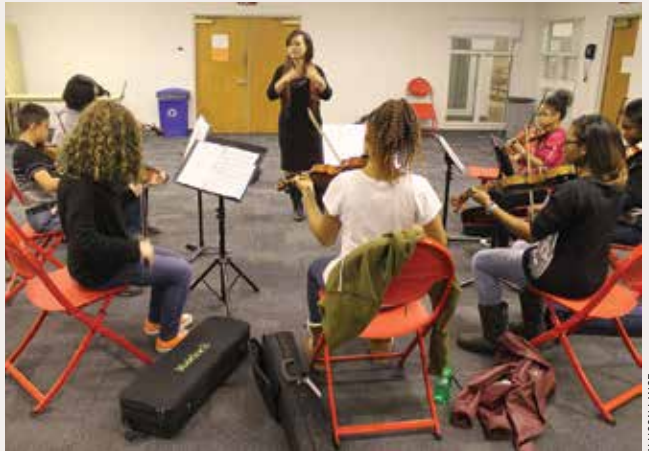
Community School of the Arts' Orchestra in Schools Reunion Class program.

Through an accessible and flexible grant-giving philosophy, the foundation supports organizations and projects of different sizes, missions, constituencies, and scale. We seek to build effective relationships with grantees through close communication and a willingness to understand the areas in which they work and the challenges they face. With every grant, the foundation seeks to empower people and sustain their work in making a lasting impact in their communities. ■