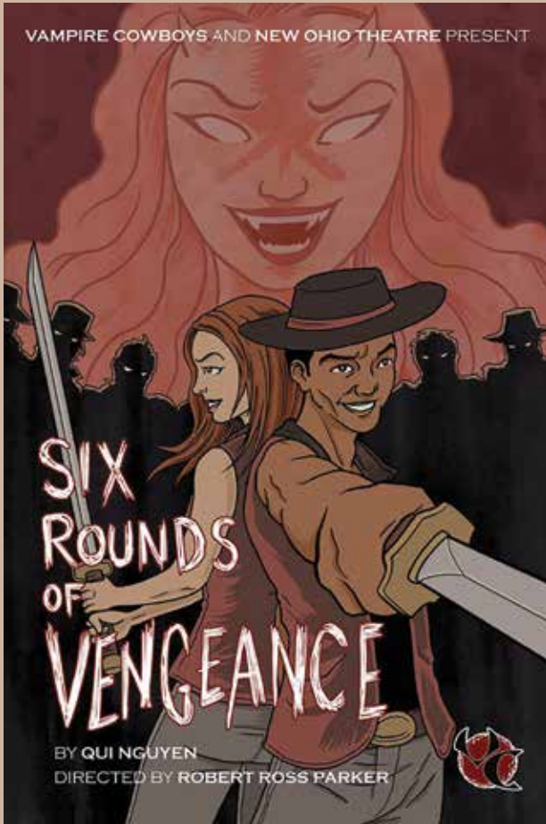
A Vampire Cowboys show, part of New Ohio Theatre's Archive Residency with IRT Theater.